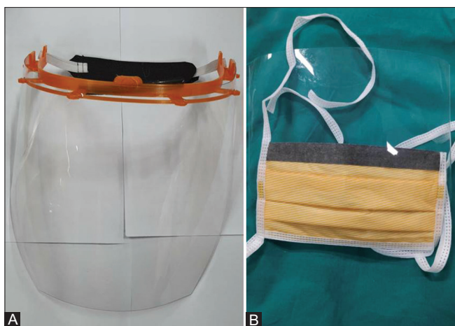
Figure 4 (A and B): (A) Face shield and (B) mask with integral visor

be disinfected easily, wearers do not need to be clean shaven, easy to don and doff, relatively inexpensive, no impact on vocalization, can be worn concurrent to other face/eye PPE, do not impede facial nonverbal communication, protects against self-inoculation over a wider facial area, and may extend the useful life of a protective facemask when used concurrently. Disadvantages of using a face shield are glare effects, fogging, may be optically imperfect, some models may not fit properly over some respirators, and may be bulkier than goggles. The major structural components of face shield are (i) visor, (ii) frame, and (iii) suspension straps. Since face shield is not a tight facial fit, it cannot be used as a replacement for a mask. Face shields provide a barrier to body fluids and are commonly used as an alternative to goggles as they confer protection to a larger area of the face.