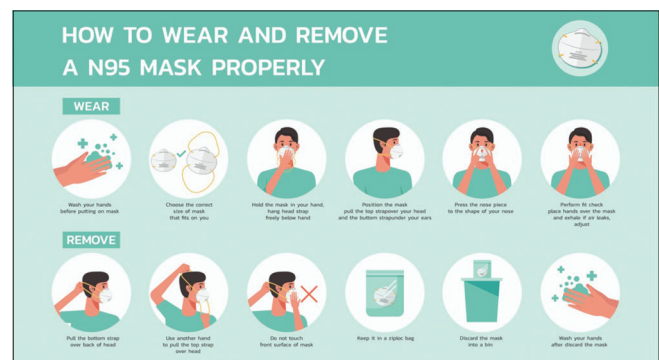
Figure 2: Donning and doffing N95 respirator