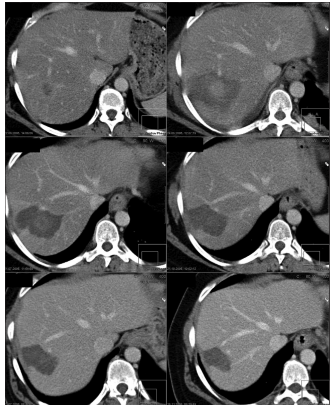
Figure 3: Sample case. Axial CT scan before and 1 day/4 weeks/4/7/14/>24 months after RFA of the same lesion illustrated in Figure 1. Typical peripheral rim of enhancement and a central area of high attenuation on the CT scan 1 day post-RFA followed by continuous shrinkage and decreasing density of the ablation zone

HCCs often arise in cirrhotic livers, while hepatic metastases often occur in formerly healthy liver parenchyma. One could expect that the shrinkage of the ablation zone proceeds more slowly over time in a cirrhotic liver