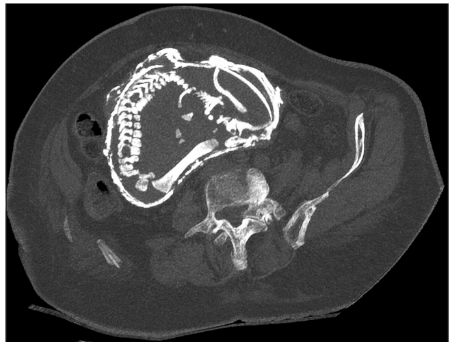
Figure 2: CT MIP reconstructions reveal the fetal anatomy in great detail, showing the calcified shell and fetus' spine

Most cases remain asymptomatic and represent incidental findings on imaging studies, surgery or necropsy. [3] An abdominal radiograph is useful to suggest or confirm diagnosis. Computed tomography and magnetic resonance