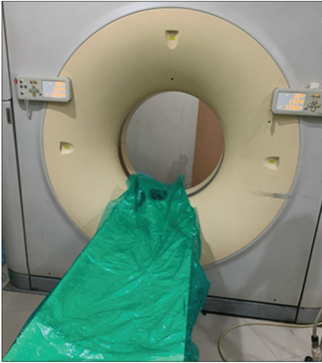
Figure 3: CT scan couch is covered with plastic polyethene when suspected or proven COVID-19 patient

and new norms of social distancing. These are new things which the diagnostic center must follow so that it's "better to be safe" and thus aid in preventing cross transmission of infection in the COVID-19 pandemic.