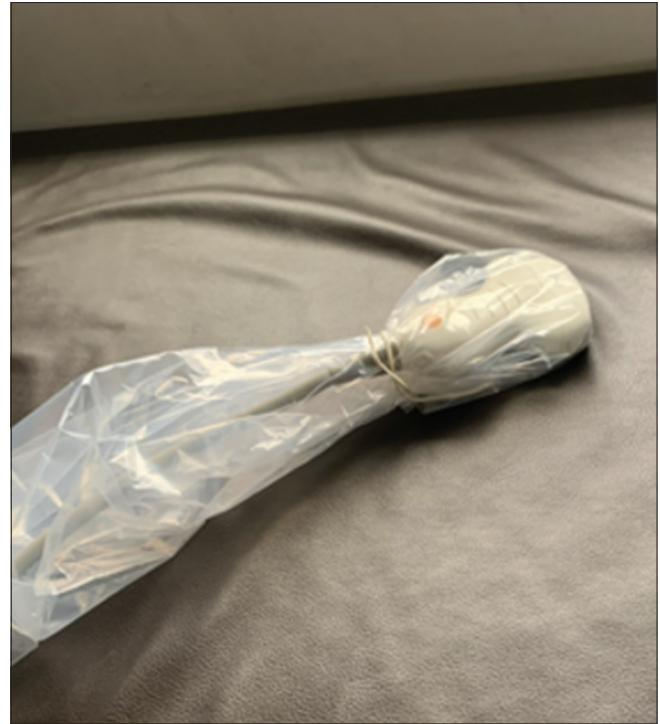
Figure 2: Ultrasound probe is covered plastic polyethene when suspected or proven COVID-19 patient