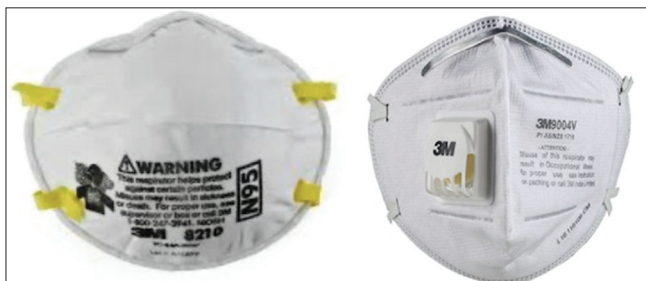
Figure 3: Unvalved and valved mask

Imaging department staff suffer from psychological pressure especially the fear of contracting the disease at the work place, further carrying the disease home. Reassurance, education about safe practices and boosting morale are very important. Shorter working hours help a lot as they are away from home for shorter periods, encouraging frequent phone calls to their homes is very useful to reassure staff and home folks. Something many work practices did not encourage in the past! Personal calls. Family support helps boost the morale of staff a lot. If they are apprehensive about carrying the disease home they may be accommodated on the hospital premises or nearby hotels.