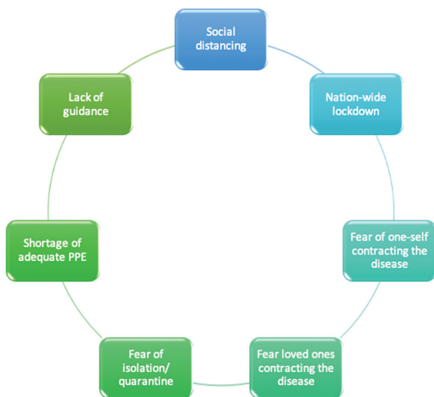
Figure 1: Factors influencing morale during the COVID-19 pandemic

Looking at the present scenario, India is presently demonstrating a community spread of COVID-19 and there is very little certainty of how this pandemic is going to unfold here further. A large part of the psychological responses has so far been reactionary to what has happened in other countries in the world, fears of what might be in store in the times ahead and responses to the lockdown. Here we discuss the psychological impact of COVID-19 on the radiology department on both the front liner radiographers, and the radiologists serving as the backbone.