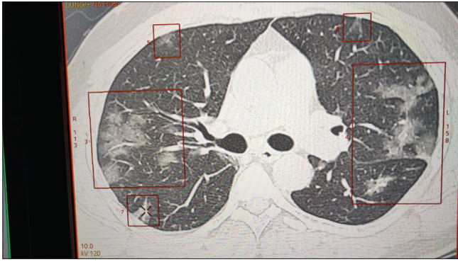
Figure 1: High resolution computed tomography (HRCT) in patients with COVID-19 suspected patients

Exclusion criteria were (1) Past medical history of Lung surgery (2) Lung Malignancy (3) age <18 years (4) Pregnancy (5) Known cases of COVID-19 prior to HRCT thorax (6) >14 days from symptoms onset to 1 st CT scan.