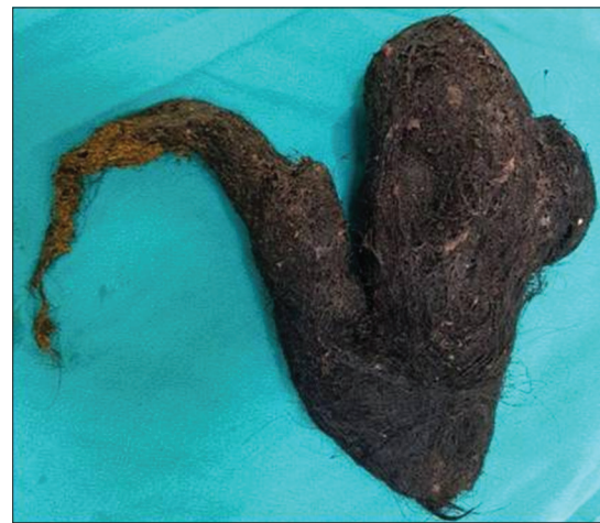
Figure 2: Surgical specimen of trichobezoar casted in shape of stomach and duodenum