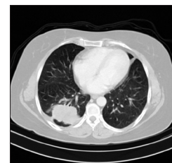
Figure 2: Contrast-enhanced computed tomography thorax: August 2017 – after 2 months of treatment with alectinib: complete resolution of pleural effusion