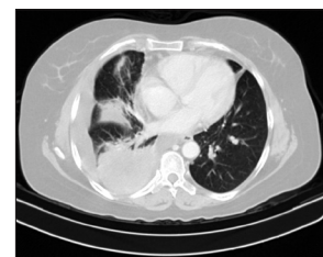
Figure 3: Contrast-enhanced computed tomography thorax: December 2017 – after 6 months of therapy with alectinib: multiple new lesions and new-onset pleural effusion

their consent for his/her/their images and other clinical information to be reported in the journal. The patients understand that their names and initials will not be published and due efforts will be made to conceal their identity, but anonymity cannot be guaranteed.