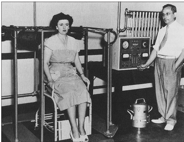
Figure 4: A volunteer shows how the multiscaler works, Dr. Saul Hertz stands next to the machine

iodine without operation... the cancer field is relatively virgin territory both from the standpoint of actual knowledge or prognostic attack [Figure 5]."