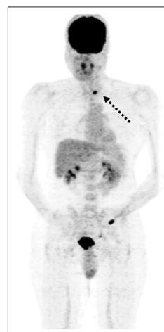
Figure 1: 18 F-fluorodeoxyglucose positron emission tomography-computed tomography scan of Hidradenitis suppurativa patient. The maximal intensity projection of a 44 years-old Malay man showing high uptake (maximum standard uptake values: 11.9) within the left thyroid nodule (black arrow)– refer figure file

The role of 18 F-FDG PET/CT studies in HS remains unknown. Hypermetabolic and inflamed tissues are known to have higher 18 F-FDG uptake than the surrounding tissues due to increased glucose uptake and vascularity. The distribution of 18 F-FDG within the body would enable the clinicians to detect hypermetabolic tissues (especially cancer), infective and inflammatory conditions (e.g., vasculitis). Functional changes precede anatomical changes much earlier, and the detection of these changes enables clinicians to initiate treatment earlier. In our study, it was shown to detect subclinical skin lesions in up to 84.4% of patients with HS. Moreover, 18 F-FDG PET/CT is able to image the whole body in a single imaging session. [5] The identification of disease