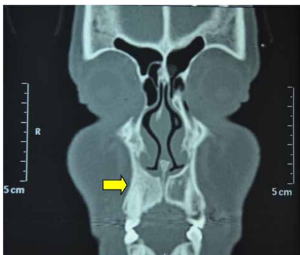
Figure 4. Coronal computed tomography indicating increased bone density in the right maxilla.

GOLLNER et al., 2010; SIMONATO, SANTOS, TAKANO et al., 2009). It is a benign condition characterized by replacement of bone by disorganized fibrous tissue and immature bone which, histologically, has numerous degrees of metaplasia (ADBELKARIM, GREEN, STARTZELL et al., 2008). This term was given pretending to indicate the condition represented a dysplastic growth resulting from disorganized mesenchymal cell activity, or a defect in the control of bone cell activity. A genetic defect involving Gs\alpha protein seems to support this process, affecting the proliferation and differentiation of fibroblasts / osteoblasts what comprises these lesions (REGEZI, SCIUBBA and JORDAN, 2012).