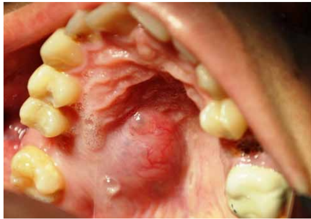
Figure 1. Occlusal view showing the swelling of the hard palate on the right side.

This tissue change entails formation of osteolytic lesions, deformities and fractures (ATALLA, HALLACK NETO,