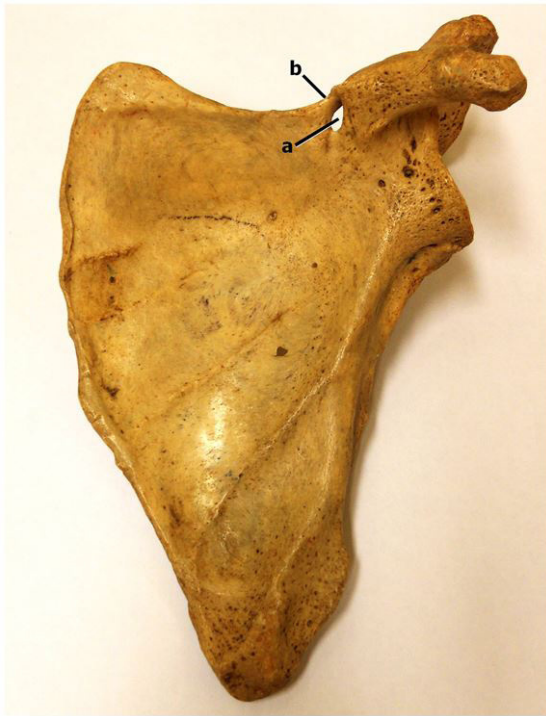
Figure 1. Showing the anterior view of a left scapular. Note the suprascapular notch (a) converted into a foramen by the superior transverse scapular ligament (b).