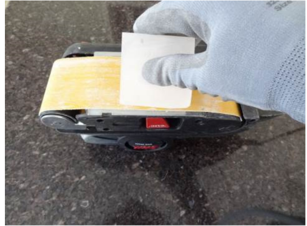
Figure 4. Piece being sanded belt sander (Skill 7640, São Paulo - SP, Brazil).

The pieces were sanded for better finishing with sandpaper in different grits (Norton, Sao Paulo - SP, Brazil), observing a sequence of thicker to thinner, being used the following grits: 100, 220, 400, 600, 1000, removing the wrinkles and blemishes on the surface of the resin. This step can be performed using an electric sander Orbital or strap type (Skill 7649, São Paulo - SP, Brazil) to facilitate and accelerate the sanding. For completion of this stage were used sandpaper of water number 1200 (Figure 4).