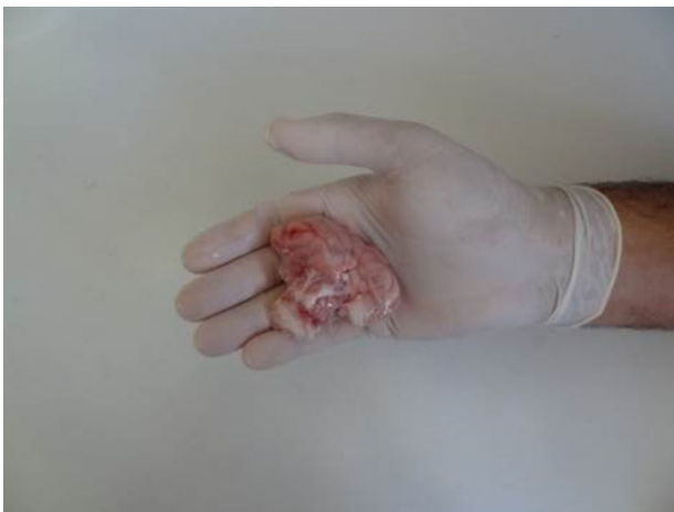
Figure 1. Natural piece with no advance fixing.

The finish was carried out using a scribe to delimit the part edges and create a template of the final shape of the pieces. After being scratched, parts of the edges were cut in saw blade type, giving the desired contour in parts.