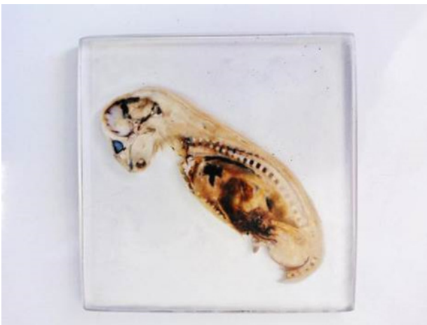
Figure 8. Other final result.