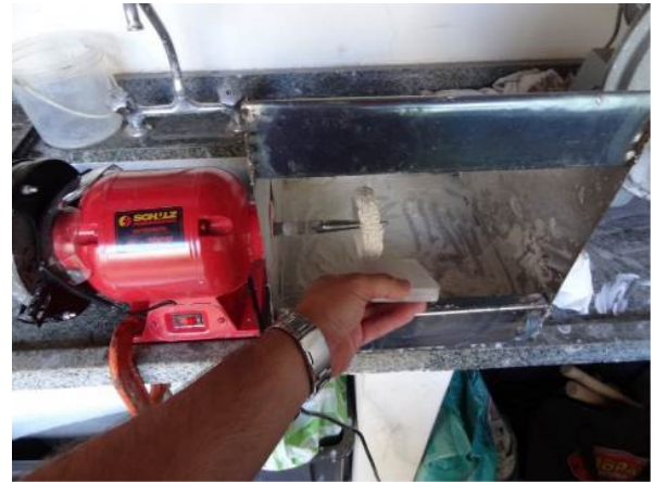
Figure 5. Piece receiving polishing with brush and Pumice stone.

Finally, fashioned into a wooden case for packaging, protection and transport of parts. This case was made in the exact size of the sum of all the piece cuts.