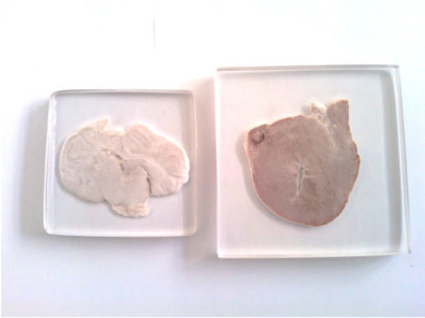
Figure 7. Final appearance of the parts after polishing.