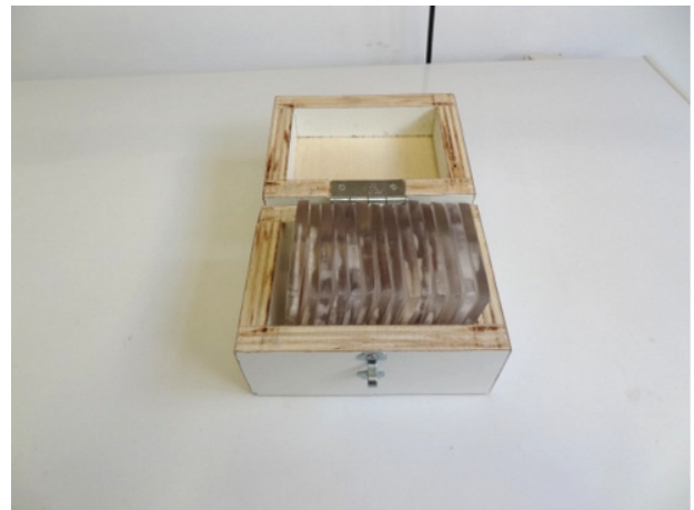
Figure 6. Case made for storing the pieces.

In the experiment, the initial phase of some aspects observed on the behavior of the front resin piece demonstrated that