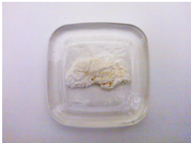
Figure 11. Whitish part with insulating usage.