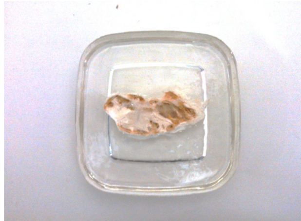
Figure 10. Part degraded due to the lack of resin.