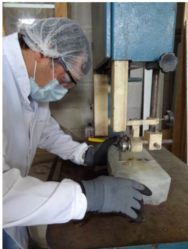
Figure 2. Saw used to cut the block of ice.