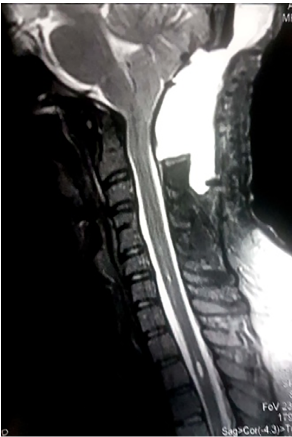
Figure 2. Sagittal T2 Cervical MRI.

Central sleep apnea is defined by cessation of airflow without respiratory effort which is due to absent or lack of ventilatory drive 1 . Syndromes that consist CSA are categorized into two groups based on wakefulness CO 2 (Hypercapnic vs. Nonhypercapnic). The causes comprise a wide variety of clinical entities ranging from physiologic central sleep apnea to high altitude, congestive heart failure, medication; medical disorders and CNS causes of decreased ventilatory drive 5 .