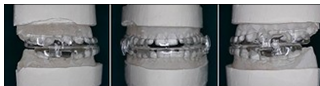
Figure 2. Customized mandibular repositioning appliance ( MicrO 2 Sleep & Snore device, Prosomnus TM , USA ). Fabricated through CAD/CAM technology ensuring a precision fit.

At the end of treatment lateral cephalograms, ESS and PSG were again repeated and the data were statistically evaluated. To determine the efficacy and efficiency of customized MRA, an elaborate examination of the pre and post-treatment dental occlusion was done on prepared study models in terms of overjet, overbite, intercanine and intermolar width in both the arches and interincisal angle, U1 - PP, L1 - MP as a lateral cephalometric parameter.