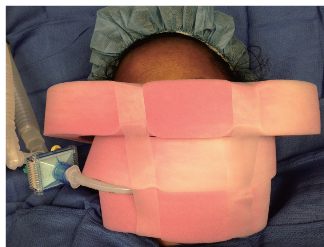
Fig. 2. The headrest components separated and placed on the patient's face during surgery.

We herein describe a simple method to guard the face from direct pressure during surgery of the upper torso. The need arose performing autologous breast reconstruction that required prolonged operating in the upper chest. This incurs the risk of the operating surgeon and assistant to inadvertently rest their elbows on the patient face,