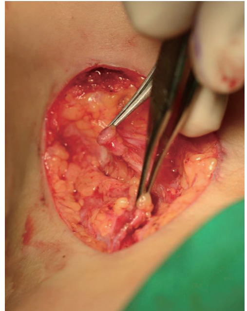
Fig. 3. Platysma flap with Z-plasty was performed for a functionally and aesthetically better prognosis.