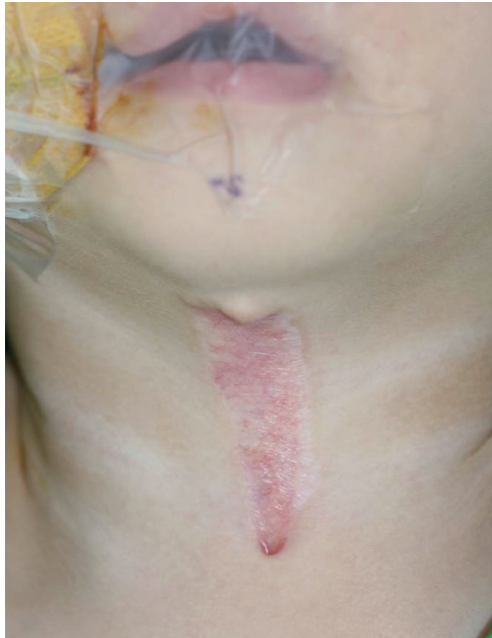
Fig. 1. Preoperative photograph shows typical characteristics of congenital midline cervical cleft.