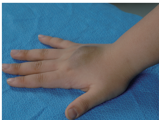
Fig. 1. Preoperative clinical photograph of the patient's hand.

GCTTS is a slow-growing soft tissue mass that