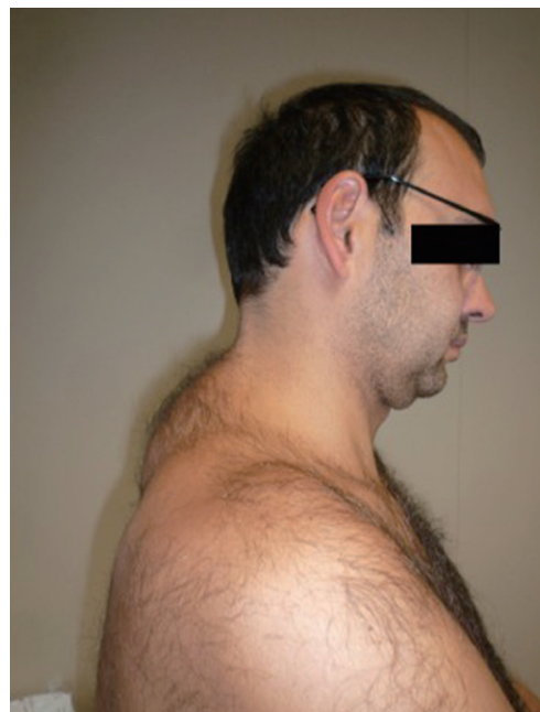
Fig. 1. Preoperative situation.

In order to document the presence of retinoblastoma, multiple endocrine neoplasia (MEN) 1 and lipomatosis were evaluated with an preoperative genetic exam to confirm the diagnosis of this rare and complex syndrome; in fact, hereditary predisposition to lipomas is observed in familial multiple lipomatosis and benign cervical lipomatosis (and can also be associated with mutations in the MEN1 and phosphatase and TENsin homolog