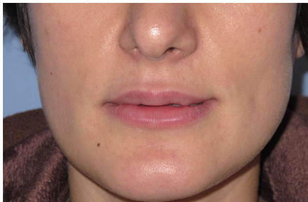
Fig. 3. Edema was almost completely resolved at 7 days post-injection.

procedural pain has been associated with the use of a filler containing HA and lidocaine [3].