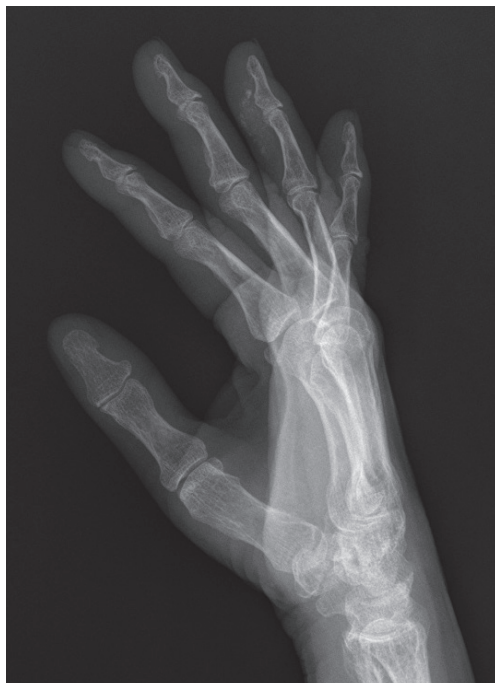
Fig. 4. Follow-up radiographic findings after two months showed the spontaneous resolution of the calcification.

appearance of the calcification had become mottled (Fig. 3), and the patient's C-reactive protein level decreased gradually. After one week of treatment, the patient experienced a complete resolution of pain and exhibited a full range of motion without difficulty. Follow-up radiographic findings after two months showed spontaneous resolution of the calcification (Fig. 4) [5].