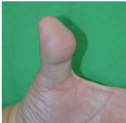
Fig. 1. A 2.5 × 2-cm protruding subcutaneous mass on the left thumb without an abnormal skin lesion.

A 53-year-old man visited our outpatient plastic surgery clinic, presenting with a slow-growing protruding mass on the left thumb (Fig. 1). He was a carpenter by occupation, and the mass developed after recurrent mechanical trauma by hammering for several decades. The 2.5 × 2-cm mass was located on the volar side of the distal phalanx of the left thumb. Upon physical examination, the mass was movable, without tenderness, redness, or a sense of warmth. We performed a simple X-ray of the hand to evaluate potential bony abnormalities and ultrasonography to determine the characteristics of the mass. The simple X-ray showed a normal bony appearance without bony erosion due to mass effect. We also found three subcutaneous low echoic masses on ultrasonography (Fig. 2). The overlying skin was incised horizontally