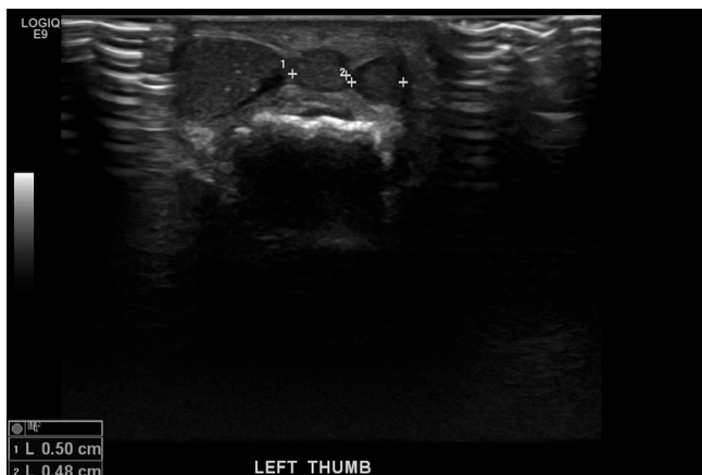
Fig. 2. Three lobulated heterogeneous hypoechoic masses were seen on ultrasonography. The size of the largest mass was 1.3 × 0.6 × 1.2 cm and the other two small masses measured 0.5 × 0.5 cm each.

and four masses were resected (Fig. 3). Mild adhesion was noted between the masses and the surrounding tissue, which was completely resected. The light microscopic examination of hematoxylin-eosin-stained sections was performed for all masses, which were diagnosed as epidermal cysts by a pathologist (Fig. 4). The wound was closed directly and followed up for two weeks. No complications, such as dehiscence, necrosis, hematoma, tingling sensation or hypoesthesia, or motility dysfunction occurred.