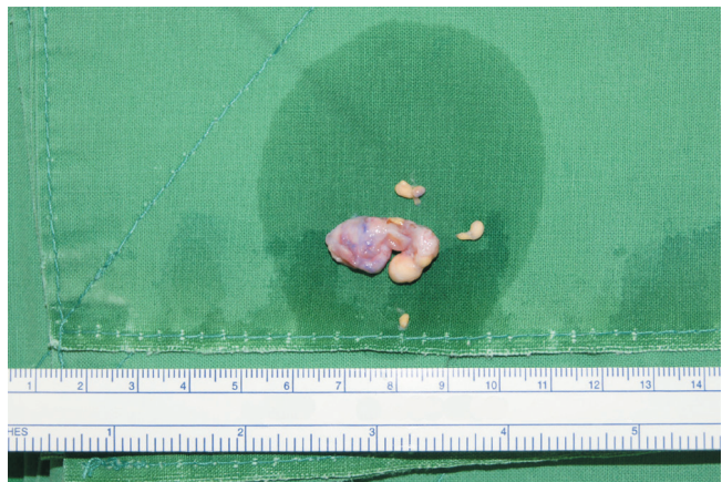
Fig. 3. During the operation, a total of four masses were removed without any remnants.

Epidermal cysts usually result from inflammation around pilosebaceous follicles [4]. However, no pilosebaceous follicles are present in the skin of the palm and the sole of the foot. Epidermal cysts in the palmoplantar skin have been assumed to result from the implantation of epidermal fragments due to a penetrating injury or another form of epidermal trauma [1,5]. Recently, some palmoplantar epidermal cysts have been reported to be caused by human papilloma virus (HPV) infection [4,5]. The pathophysiology of the epidermal cyst in this patient was presumed to be the implantation of an epidermal fragment, since the patient in this case had a history of recurrent occupational mechanical trauma [1,3]. We did not test for HPV infection because the patient did not present any symptoms or signs thereof. Epidermal cysts in the palmoplantar skin are easily confused with warts or calluses. Surgeons should be aware of the possibility of epidermal cysts in palmoplantar skin and be able to diagnose them correctly and design an appropriate treatment strategy.