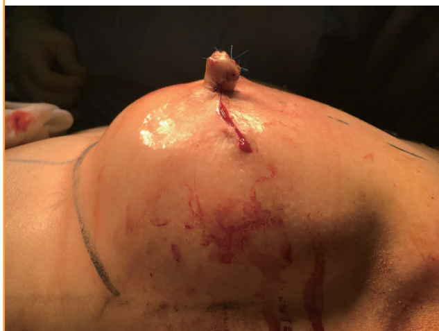
Fig. 3. A patient case of nipple reconstruction

The cross-section of the nipple forms an upside-down quadrilateral with a narrower width at the base than at the top.