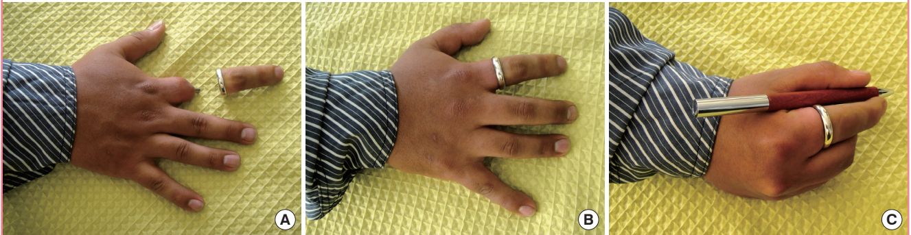
Fig. 5. Patient with amputation of multiple digits

(A) Postoperative picture of Patient 1 with the right index finger prostheses prior to insertion with exposure of magnetic tip. (B) Fitting of the right index finger prostheses to demonstrate color and length match. (C) Patient demonstrating fitting of pen into the right hand (writing) as a functional outcome.