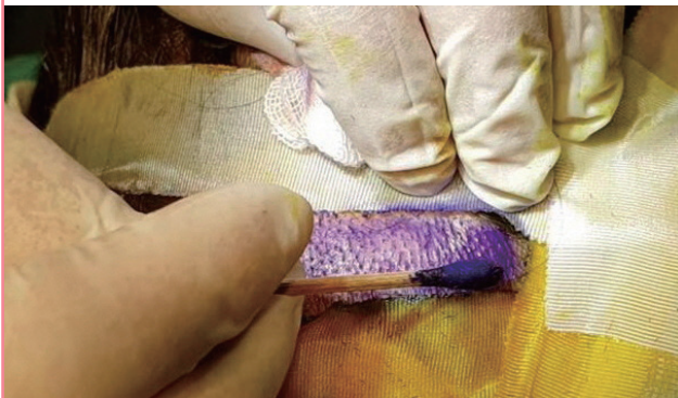
Fig. 2. Pre- and post-dyeing of the first patient

Scalp skin dyeing with 1% gentian violet (G-V) solution. We applied the solution with a toothpick or cotton swab.