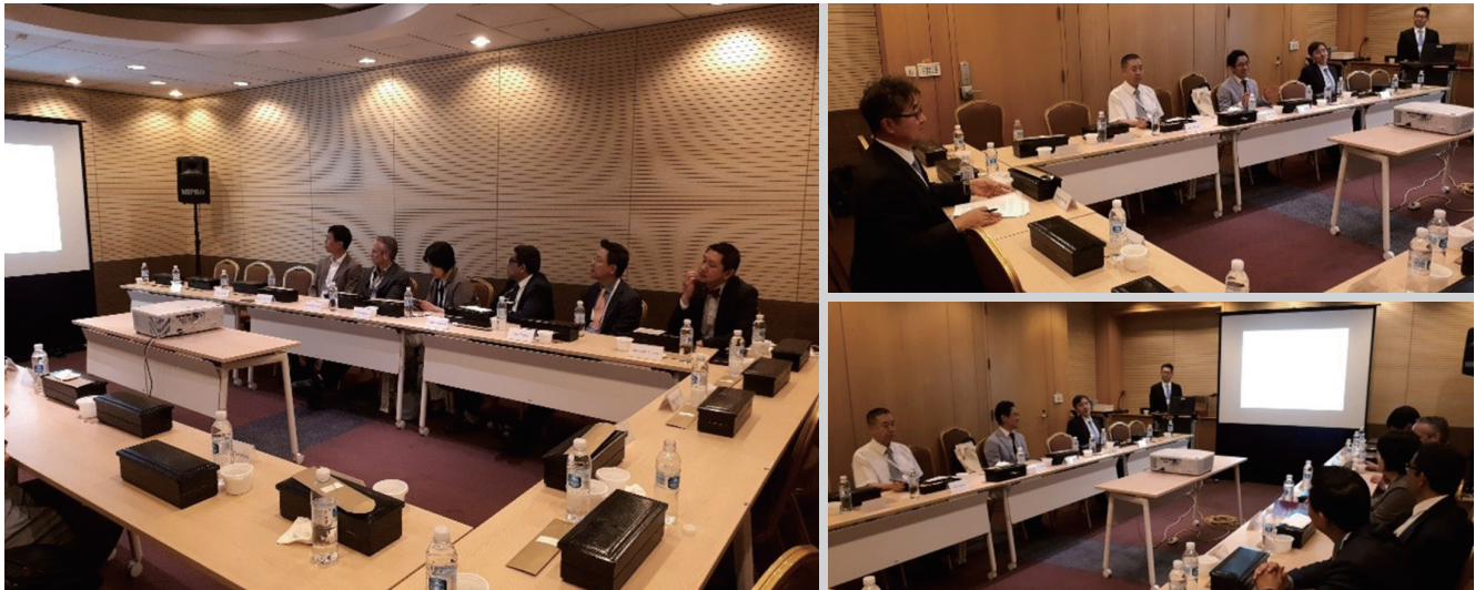
Fig. 1. The first global editorial board meeting of Archives of Plastic Surgery was held on June 15, 2017, during the Ninth Congress of the World Society for Reconstructive Microsurgery.

hope to make the submission process more user-friendly.