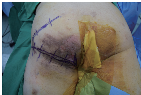
Fig. 1. A 48-year-old man with a recurrent ischial sore on the left buttock showing abrasions and seroma (incision line drawn with a violet marker).

Considering the patient's ambulatory ability and the shortage of tissue due to the recurrence of the sore, we believe the usage of the 3-flap technique presented above was an appropriate treatment (Fig. 4). Thus, we must consider each patient's condition