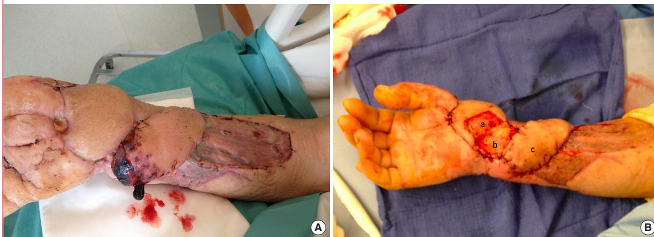
Fig. 3. Flip-flap puzzle flap for case 2

(A) Figure A shows the preoperative view of the patient's forearm with a distal necrosis of a radial collateral artery perforator (RCAP)-based perforator flap. (B) Figure B shows the immediate postoperative view of a flip-flap puzzle flap harvested from the interosseous posterior flap (a, donor site on the interosseous posterior flap; b, flip-flap puzzle flap; c, RCAP-based propeller flap).