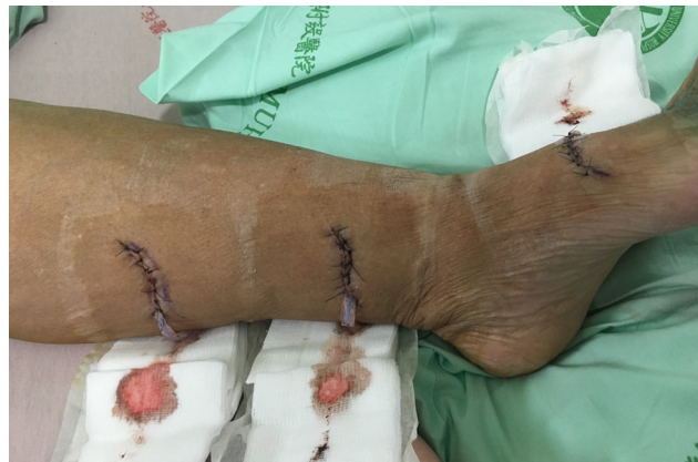
Fig. 2. Postoperative wounds. Simple interrupted sutures for wound closure over a short Penrose drain following lymphaticovenous anastomosis at multiple sites in the lower limb. The wound was covered with gauzes and Micropore tape (without a compression bandage or stocking). Skin wrinkling, indicating improved lymphedema on the morning after surgery.

Although immediate compression garments are becoming increasingly common after LVA at many centers, we are concerned that the delicate, thin-walled vessels of microanastomoses would collapse due to mechanical compression. This would