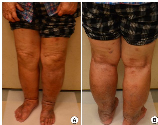
Fig. 3. Postoperative photographs. (A) Front view and (B) rear view.

stimulate coagulation within microanastomoses and cause failure of the lymphatic fluid bypass.