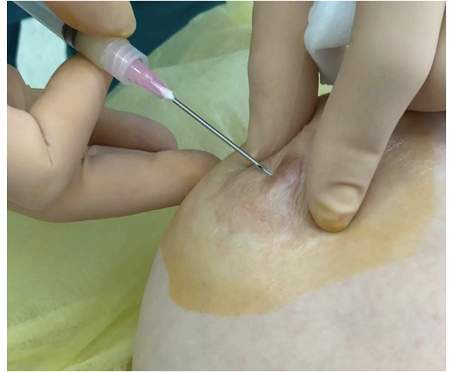
Fig. 1. Surgical procedure. The outpatient procedure involved an injection of approximately 1 mL of Integra Flowable Wound Matrix without anesthesia through an 18-gauge needle.

At this stage, on average, 1 mL of IFWM was injected. Keeping the nipple still between the thumb and forefinger, an 18-gauge needle was threaded through the base of the nipple up to its central point, orientated at 45° to the major axis of the nipple. The gel-like IFWM was slowly injected until the desired projection was obtained. Due to the gelatinous consistency of the IFWM, it was usually necessary to apply some pressure on the plunger of the syringe. Normally, we injected no more than 1 mL of IFWM (Fig. 1). We suggest using one kit for each patient as best practice. However, while maintaining strict adherence to sterility rules, it may be possible to divide the initial syringe content into three equal parts of 1 mL that are transferred to three luer-lock syringes, enabling a single kit to be used for three different patients consecutively. At the end of the surgical proce-