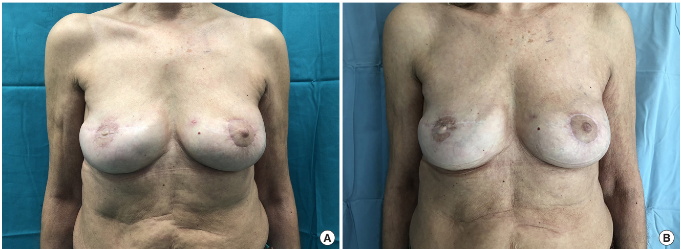
Fig. 3. Nipple reconstruction case with a graft. (A) Preoperative front view of a patient whose right nipple was reconstructed using the nipple sharing technique. (B) Postoperative front view 6 months after the injection of Integra Flowable Wound Matrix into the previously reconstructed right nipple.

IFWM and its progenitor, the Integra Dermal Regeneration Template (IDRT), are not interchangeable. The difference is not in their composition, as both are composed of cross-linked bovine tendon collagen and glycosaminoglycan, but in their physical state. IFWM is sold in a syringe containing granulated and dehydrated components that must therefore be hydrated before injection. IDRT, instead, is solid and is sold in sheets composed of two layers (a thick inner layer made of collagen and glycosaminoglycan and a thin outer layer made of silicone).