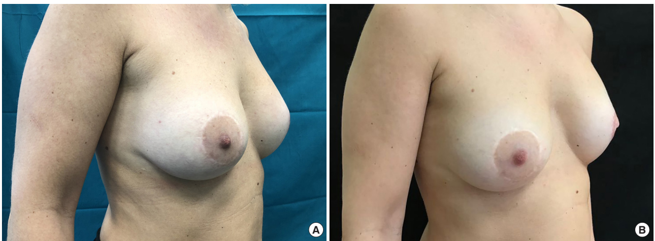
Fig. 4. Nipple reconstruction case with a C-V flap. (A) Preoperative lateral view of a patient whose left nipple was reconstructed with a C-V flap. (B) Postoperative lateral view 6 months after the injection of Integra Flowable Wound Matrix into the previously reconstructed left nipple.