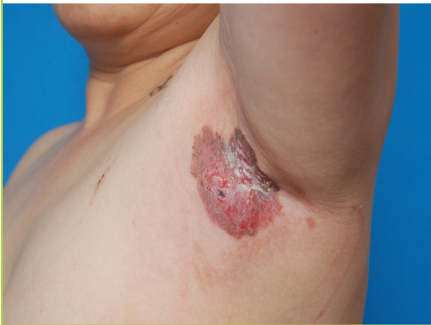
Fig. 2. Skin punch biopsy

A 7.0 × 6.0 cm lesion on the left axilla with erythema, brownish pigmented plaque, erosion, and scales.