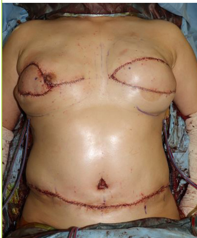
Fig. 2. Flap congestion on postoperative day 6

Immediate postoperative photo of the deep inferior epigastric perforator (DIEP) free flap.