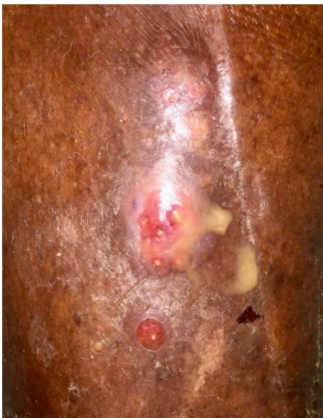
Fig. 3. Atypical findings. Case 2 presented with a mid-tibial ulcer in the absence of known trauma which is atypical for cutaneous mucormycosis. The ulcer had been present for about 4 months and began blistering and draining purulent fluid a week prior to presentation.

At admission, the patient had an elevated erythrocyte sedimentation rate and C-reactive protein above 120 mg/L. Initial debridement demonstrated widespread purulence around the tibia and erosion of the bony cortex. Over 20 cultures were collected at this time which were all initially negative. Repeat debridement on DOA 8, revealed a clean wound (Fig. 4). However, a single culture began to grow mold on DOA 9; thus, vori-