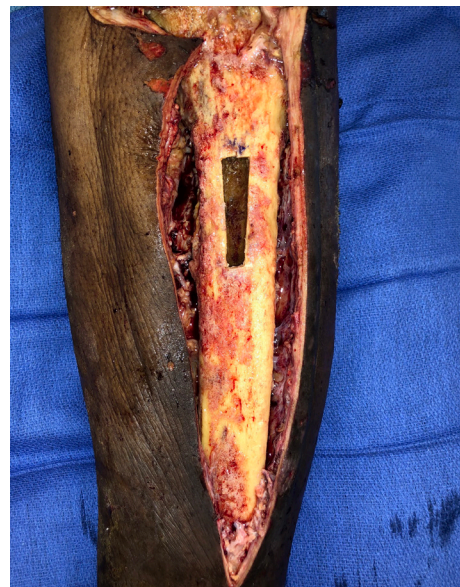
Fig. 4. Initial debridement of case 2 wound. There were widespread pitting and infection of the tibia that appeared non-salvageable. At this time, the knee joint appeared clear and preliminary plans for a stage below knee amputation were made pending cultures and pathology.