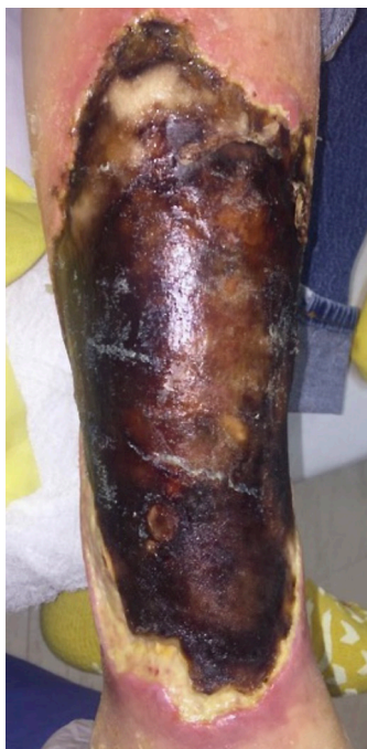
Fig. 1. Classic findings. Case 1 presented with a 22×14 cm anterior right lower leg wound with significant eschar without signs of systemic illness. The wound began as a small skin tear secondary to a fall 2 months prior.

Cutaneous mucormycosis, the third most common form, often affects immunocompetent patients [4]. Only 10% to 15% of cases are reported to involve diabetic hosts [4]. The most common risk factor, implicated in up to 88% of cases, is penetrating trauma with soil being the source of inoculation [2,4]. Burns, surgery, persistent maceration, and subcutaneous or intramuscular injections are also risk factors [2,4]. Cutaneous infection can remain localized, invade deeper structures (e.g., muscle, tendons, and bones), or disseminate to other organs [4]. When deep extension occurs, it usually presents as necrotic eschar with surrounding erythema and necrotizing infection [4]. However, cutaneous mucormycosis may also present indolently with skin findings limited to a small erythematous macule [3]. Urgent, aggressive surgical debridement is the cornerstone of treatment for all presentations of cutaneous mucormycosis [2]. Prompt diagnosis, control of predisposing factors, and appropriate antifungal treatment are also essential [2]. We report two cases of lower extremity cutaneous mucormycosis with deep extension in diabetic patients. These are the first reported cases