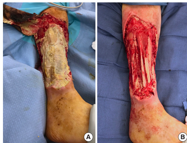
Fig. 2. Initial debridement of case 1 wound. Frank purulence beneath the eschar with necrotic tissue throughout the entire anterior compartment down to tibial periosteum (A) was appreciated requiring aggressive surgical debridement (B).

At admission, tibia/fibula radiographs showed soft tissue irregularity consistent with superficial ulceration and no features of osteomyelitis. Intravenous doxycycline was initiated for empiric coverage. Surgical debridement on the 2nd day of admission (DOA), revealed frank purulence beneath the eschar with necrotic tissue throughout the entire anterior compartment down to tibial periosteum (Fig. 2). At this time, preliminary cul-