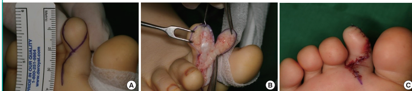
Table 1. Data of pediatric patients who underwent partial second toe free pulp transfer documented by chart review (n=18)

(A) Flap design on the medial side of the second toe. (B) Flap elevation and harvesting along the pre-tendinous layer with neurovascular bundle. (C) Donor site was closed primarily.