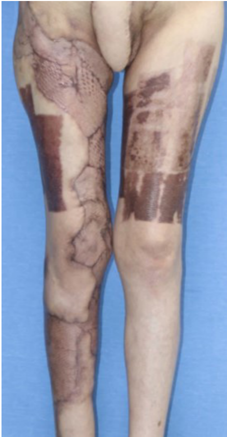
Fig. 3. Postoperative 3-month clinical photograph

left labium majus, which had relatively minor tissue loss, was covered with a local flap, whereas the right labium majus, with relatively severe tissue loss, had a defect measuring 8 \times 8 cm and could not be covered by a local flap. Therefore, it was covered with a pedicled vertical rectus abdominis musculocutaneous flap. Split-thickness skin grafts were performed for the skin defect on the entire right lower limb. The wound healed after surgery, and the patient was discharged without any complications (Fig. 3).