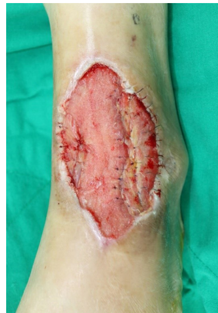
Fig. 2. Intraoperative photograph of dorsal view. The tendons were turned over so that the posterior surface could behave as the anterior side and fixed together to the surrounding granulation tissue or dense remnant fascia using 5-0 Vicryl sutures.