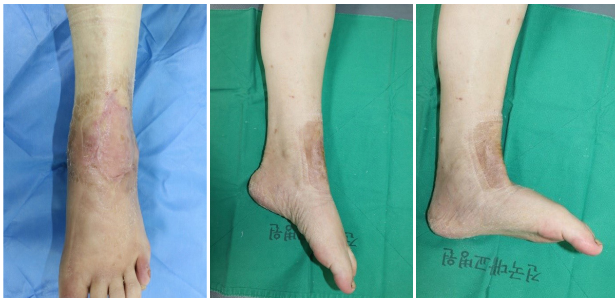
Fig. 4. The skin defect was completely reconstructed 1 month after surgery. The motion of the ankle was similar to its preoperative range. (A) Dorsal view. (B) Plantar flexion was possible. (C) Dorsiflexion was possible.

The vascular supply of tendons has three main components. The first is the musculotendinous junction, the second is the os-