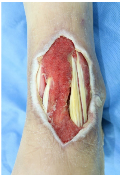
Fig. 1. Preoperative photograph of dorsal view. An 8 × 8 cm full-layer skin defect was observed with exposed tendons in a 48-year-old male patient with diabetes mellitus. From the left, the extensor hallucis longus, the tibialis anterior tendon, and the extensor digitorum longus tendons were exposed.

The skin graft site was observed to be stable 3 days after the skin graft operation. This was followed by simple dressing changes using foam material daily. A small disruption (1 × 2 cm)