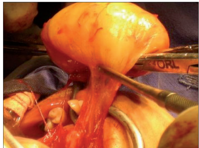
Figure 3. Surgical removal of the cyst. Capsule integrates. HC / UFG 2008.